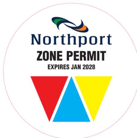
Example of Sticker for a Vehicles Windscreen.

An issued permit sticker is accompanied by a 1-page instruction sheet, which includes the Port Map. This 1-Page document is shown in Appendix 3: Northport Light Vehicle Zone Permit Instructions